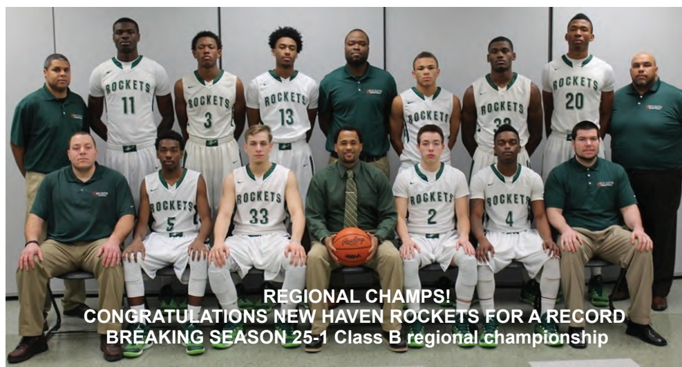
REGIONAL CHAMPS! CONGRATULATIONS NEW HAVEN ROCKETS FOR A RECORD BREAKING SEASON 25-1 Class B regional championship